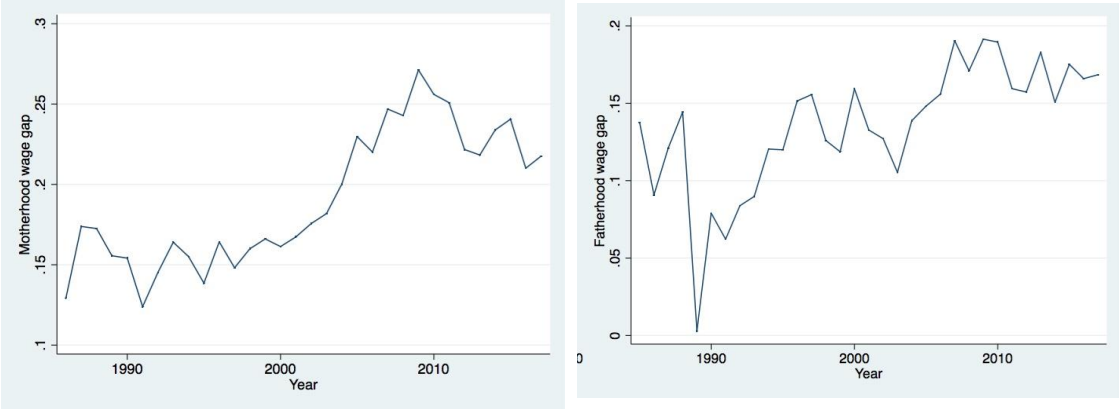
Figure3. Motherhood & Fatherhood wage gap in Thailand (1985-2017)

Source: Authors' Calculation from LFS (1985-2017)